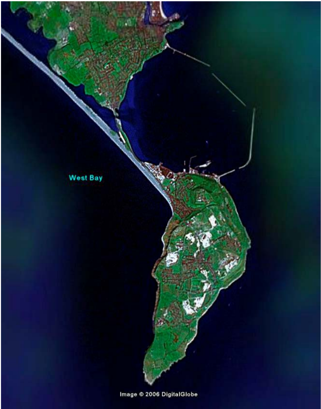
The venue: 50 deg 34' 12.05" N 2 deg 27' 10.84" W from 10 miles