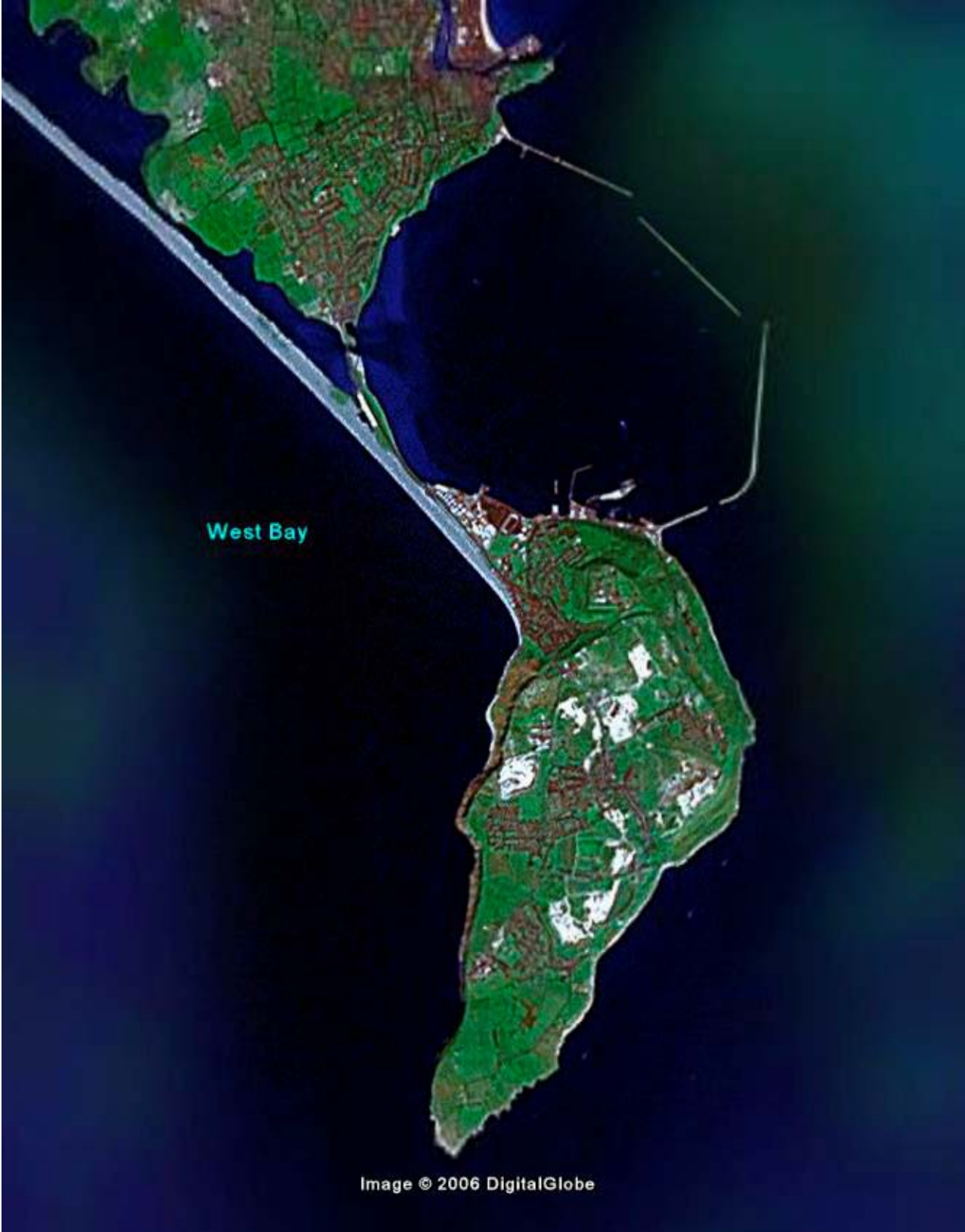
The venue: 50 deg 34' 12.05" N 2 deg 27' 10.84" W from 10 miles